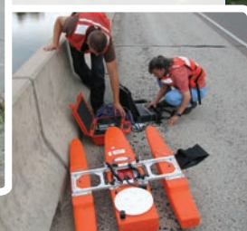
Acoustic Doppler current profiler