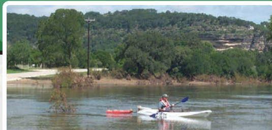
Measuring stream discharge during flood using tethered acoustic Doppler current profiler

Flood Warning Networks Flood Inundation Mapping Flood Frequency Estimation Hurricane Storm Surge Monitoring Acoustic Discharge Measurements Annual Peak Discharge Basin Characteristics Flow Duration Analysis Gain-Loss Surveys Bathymetric Surveys Watershed Modeling Hydraulic Analysis Wave Spectral Analysis Geographic Information System (GIS) Applications Precipitation Gages Real-Time Stream Gages Evaporation and Evapotranspiration (ET) Gages Time-of-Travel Studies High-Water Marks and Indirect Measurements of Peak Discharge