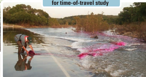
Release of Rhodamine dye for time-of-travel study

MISSION: To provide reliable, impartial, timely information that is needed to understand the Nation's water resources.