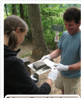
Subsampling a lake-bottom sediment box core