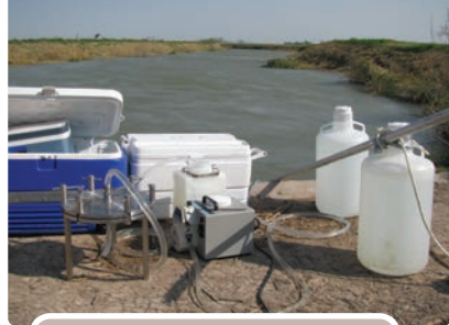
Large-volume suspended-sediment (LVSS) sampling equipment