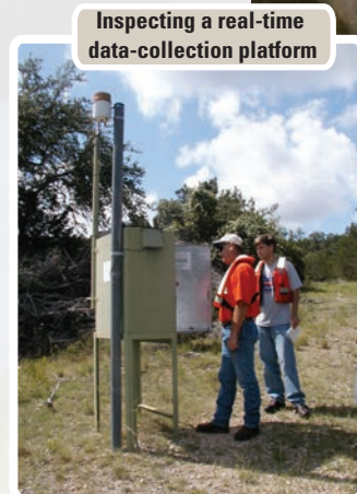
Inspecting a real-time data-collection platform