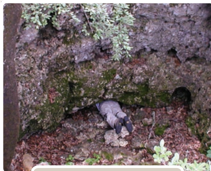
Entering a karst recharge feature

MISSION: To provide reliable, impartial, timely information that is needed to understand the Nation's water resources.