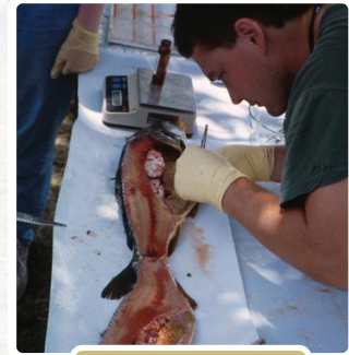
Fish tissue sampling