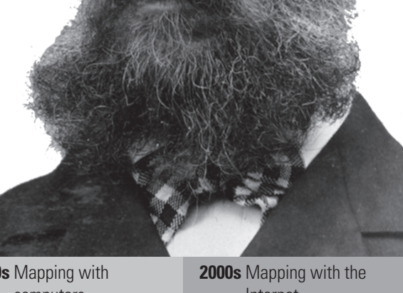
1990s Mapping with computers